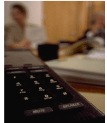
Streamlining the referral process is one of the goals of the SE Ohio ADRN.